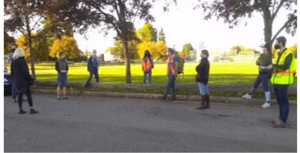
Gathered feedback on neighborhood projects.