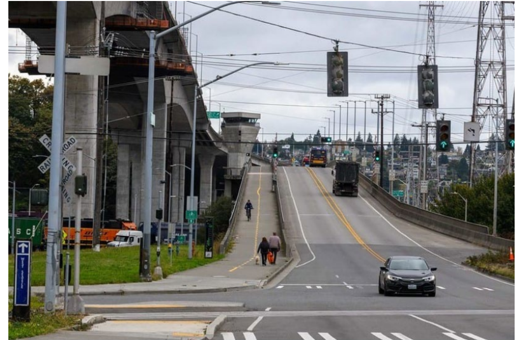
Working with stakeholders on Low Bridge access policy.