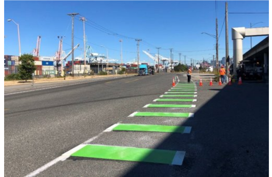
Added E bike lane striping and posts to separate bikes from traffic on E Marginal Way.