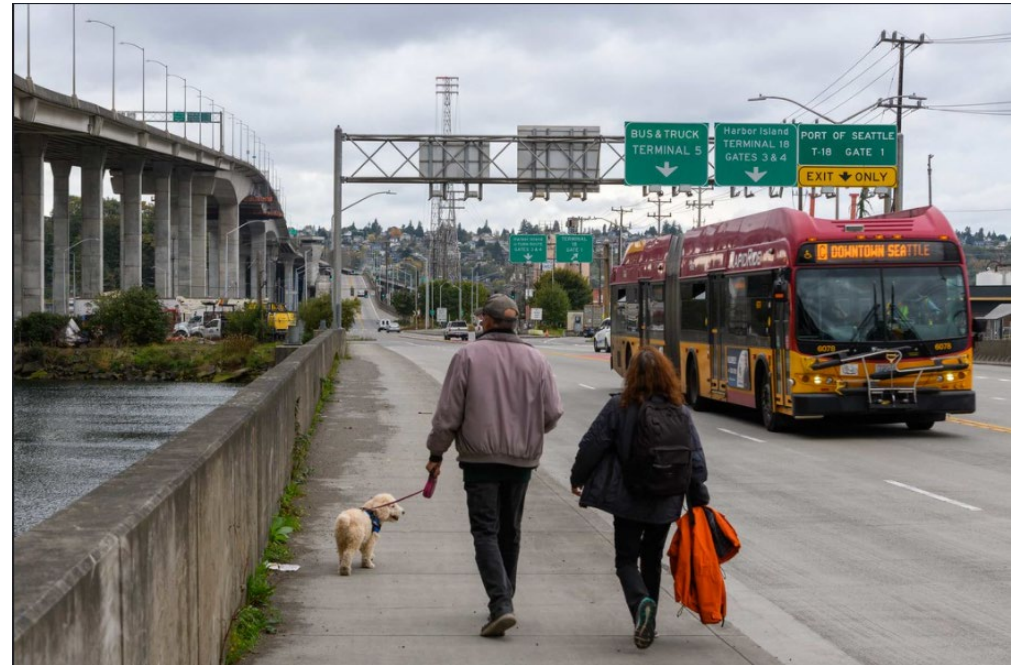
Prioritized transit service, along with walking and biking on Low Bridge.