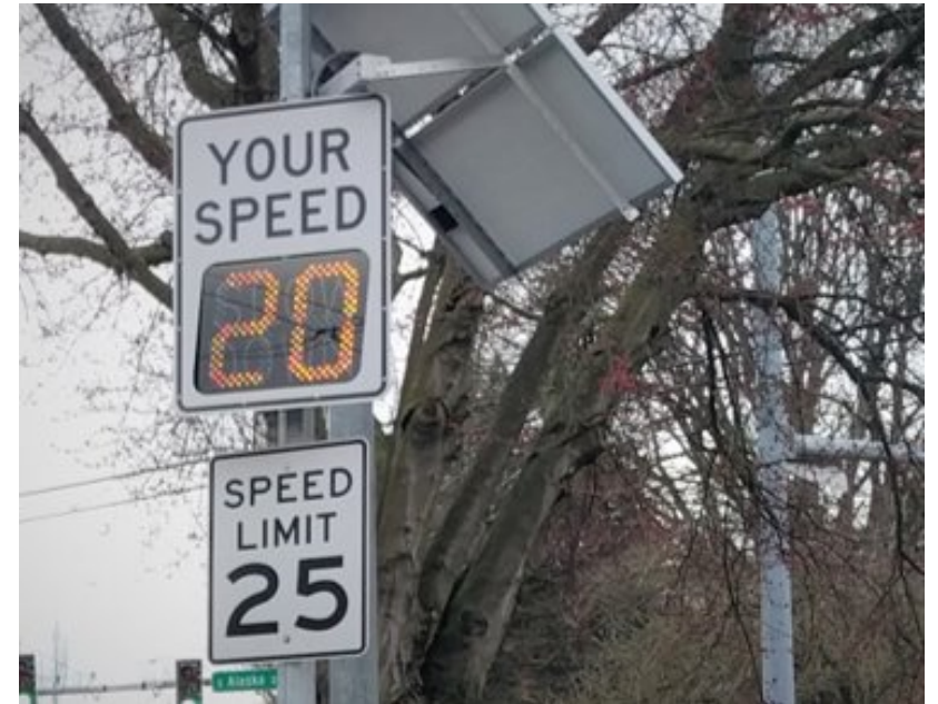
Installed speed radar signs in multiple neighborhoods.